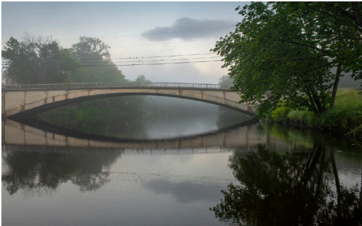
Centennial Bridge, 2019

The Stanley Mill Pond was crossed by boat until 1845 when a float bridge for foot traffic was built. In 1849, a 2 way covered bridge was built & in 1851 a storm blew it down. In 1852, a chain bridge costing $1800 was erected. After breaking down twice, once in 1859 and again in 1909, money was raised for a concrete bridge. In 1916 the Centennial Bridge was installed. So named as 1916 was the Centennial year of Kingfield's incorporation in 1816. The bridge's 174 foot span, at the time, was probably the longest span of a flat arch concrete bridge in existence in America.